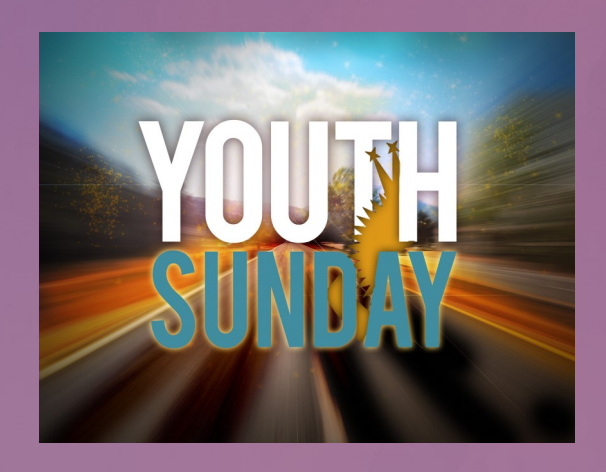
Sunday, May 7, 2017 PARENTS OF HIGH SCHOOL SENIORS

By midnight on April 15 to save $20 per camp!! All camp dates and information are on the website!