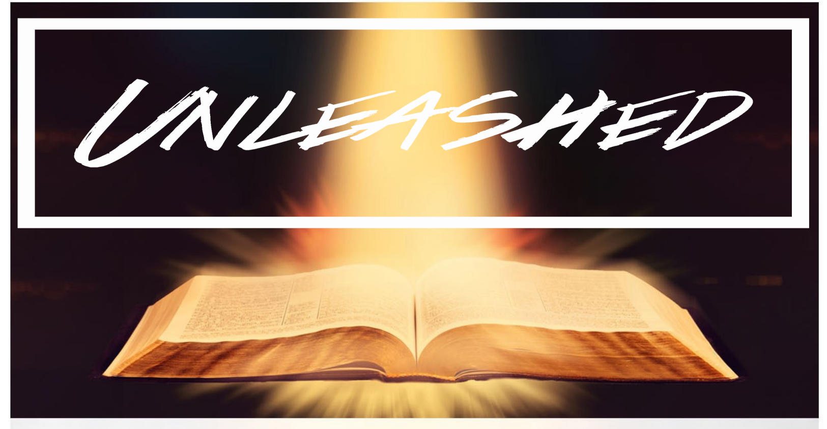
MONTHLY NEWSLETTER OF OAKLEY CHRISTIAN CHURCH | JANUARY 2017