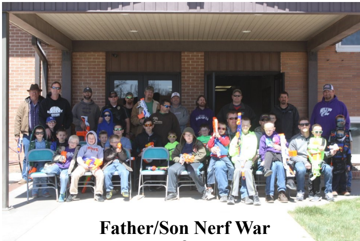
Father/Son Nerf War & Mother/Son Laser Tag Both held in April at OCC

Thursday, May 3 | 12:15 pm Meet at the City Building