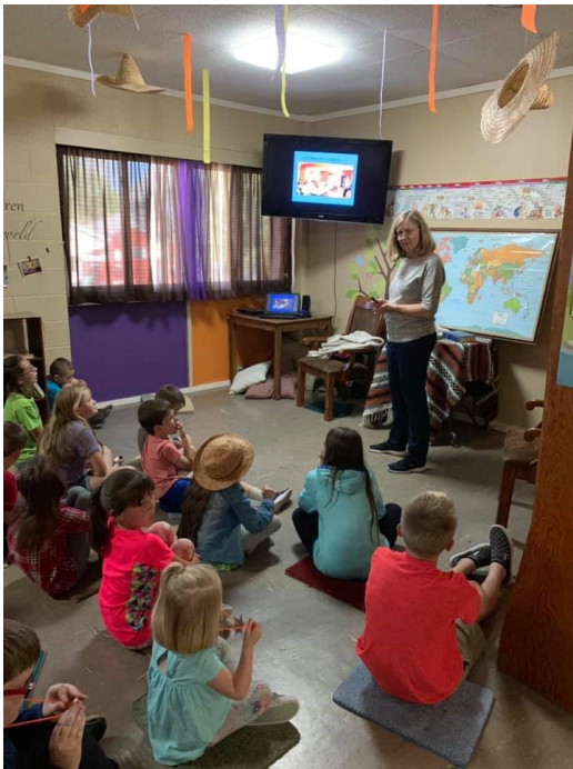
To see a video review and more VBS pictures, go to our Facebook page, Oakley Christian Church.